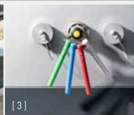
[ 3 ]