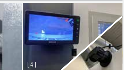
[ 4 ]