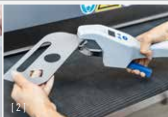
[ 2 ]