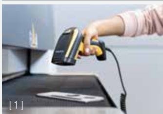
[ 1 ]