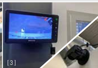
[ 3 ]