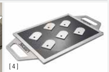
[ 4 ]