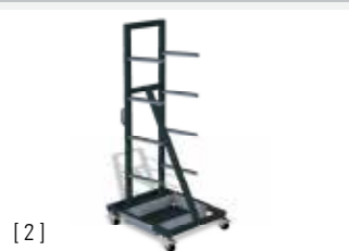
[ 2 ]