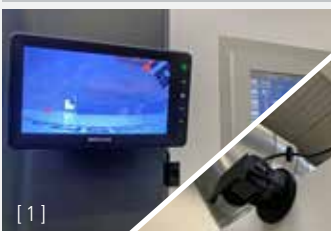
[ 1 ]